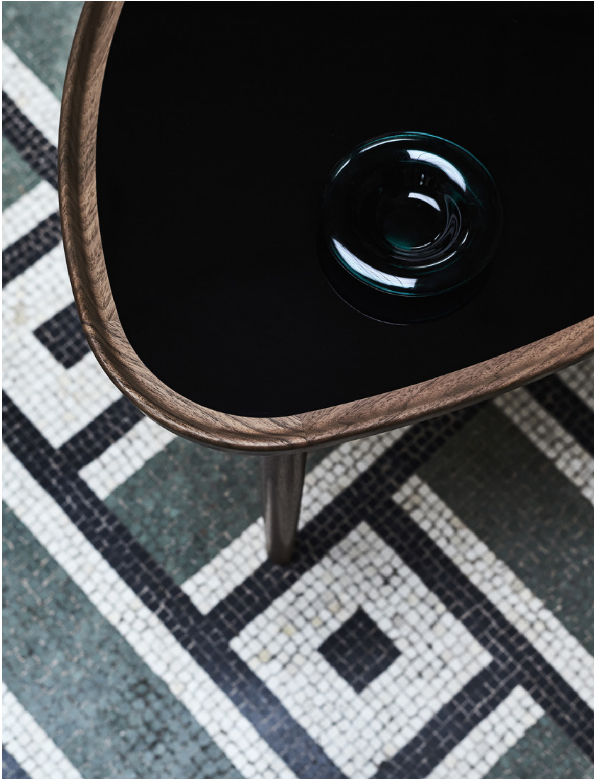
EYE TABLE 1948 BY FINN JUHL