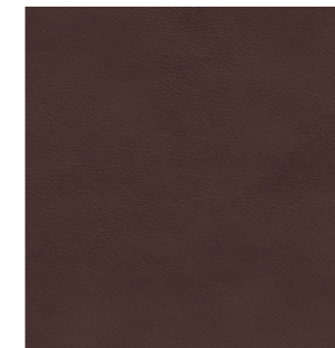
BURGUNDY - 40789