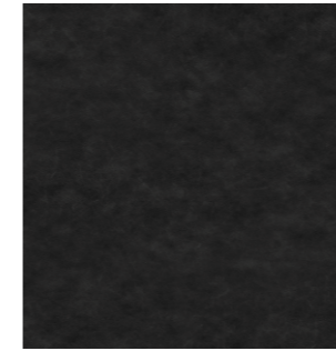
SHADOW GREY - 40780