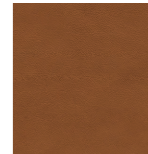
RUST - 40786