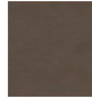
DARK BROWN - 40791