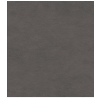
EARTHY GREY - 40781