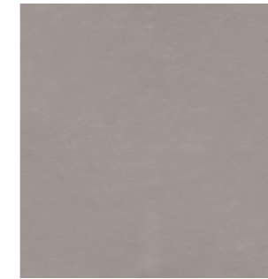
LIGHT GREY - 40782