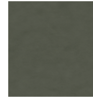
DARK GREEN - 40787