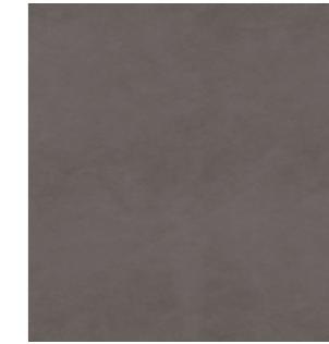
SMOKED GREY - 40784