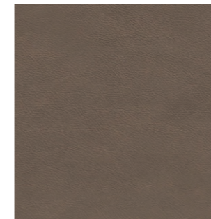
CINNAMON - 40788