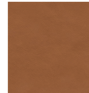
WALNUT - 40790